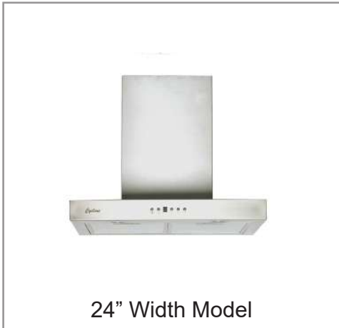
24" Width Model